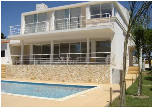
3 Bedroom villa with private pool