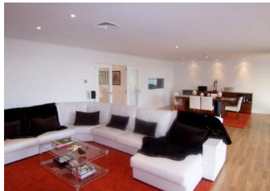
Living room (52.7m2)