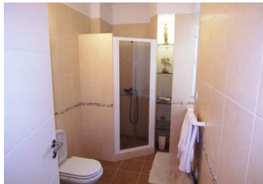
Bathroom 1 (4.2m2)