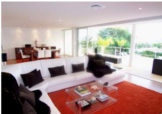
Living room (52.7m2)