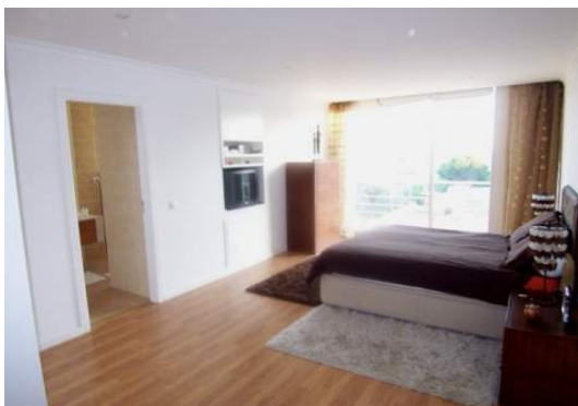
Master bedroom (26m2)