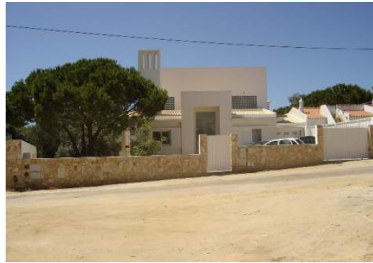
3 Bedroom villa